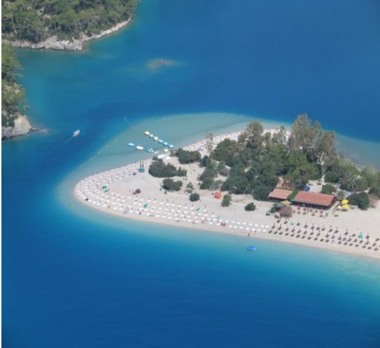
Oludeniz (Blue Lagoon)