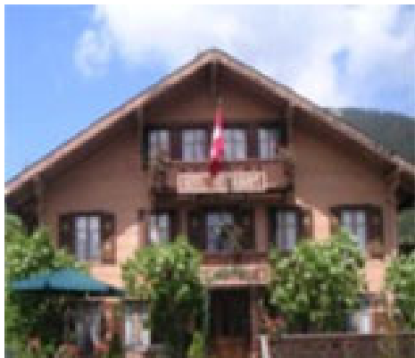
Le Beausite Chalet Hotel - Morgins