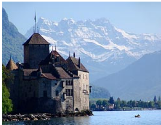
Castle of Chillon, Montreux.